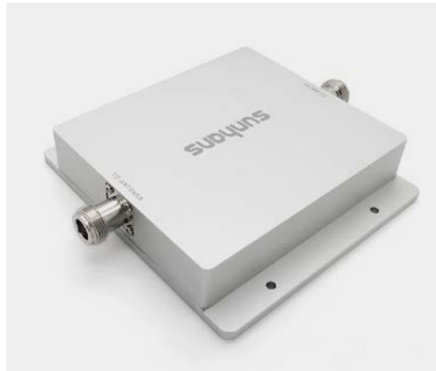
SH24Gi20W/SH24Go20W 2.4GHz 20W 43dBm Indoor/Outdoor