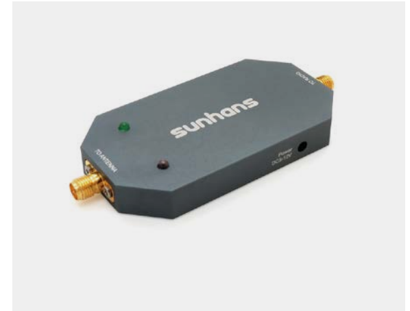
SHPro58GTX4W TX 5.8GHz 4W 36dBm