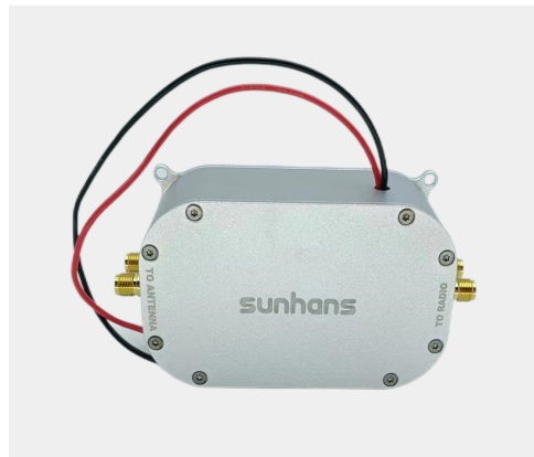
SH58Gi4WMIMO 5.8GHz 4W 36dBm Indoor