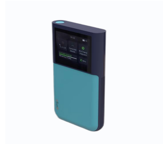
5G eSim MiFi SHFiEL62