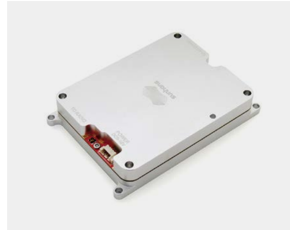
SHRC5824G4WP 2.4GHz/5.8GHz 4W 36dBm