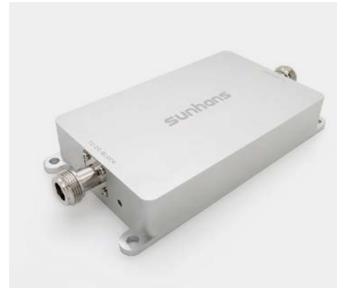
SH24Gi10W/SH24Go10W 2.4GHz 10W 40dBm Indoor/Outdoor