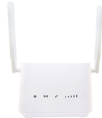
Cat 4 4G Indoor Router SHFi4G8X5Z