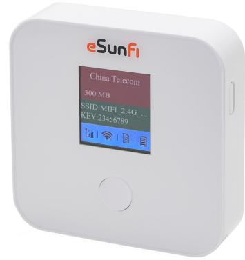
4G eSim MiFi SHFiEL40