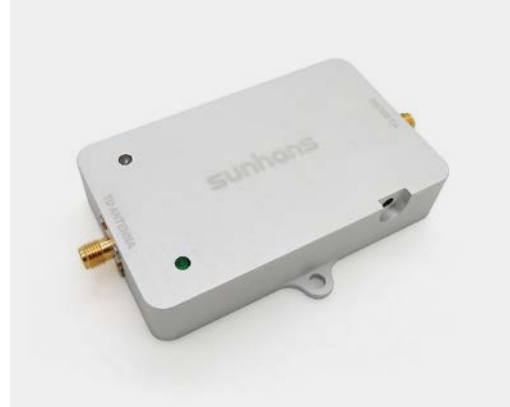
SH58Gi4000P 5.8GHz 4W 36dBm Indoor