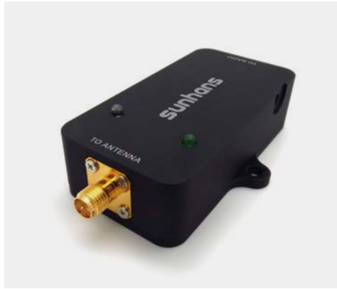
SH24BTANP 2.4GHz 3W 35dBm Indoor