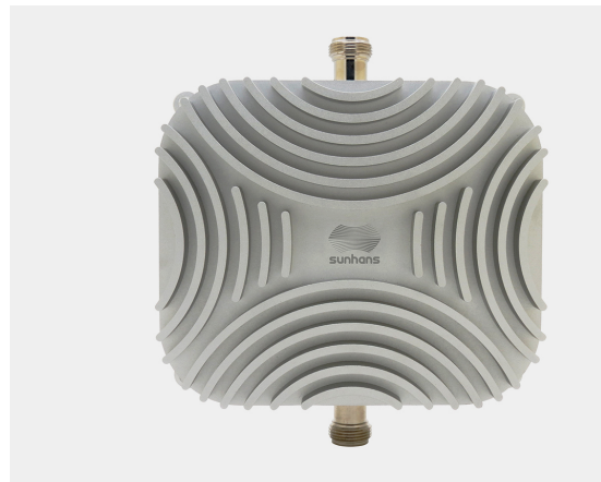
SHPro58Gi 10W/SHPro58Go 10W 5.8G 10W Indoor/Outdoor