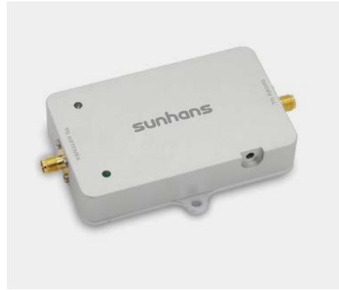
SH24Gi4000P 2.4GHz 4W 36dBm Indoor