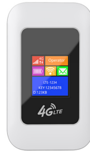
Cat 4 4G MiFi SHM7520A