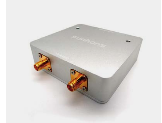
SH58Gi1000D2P 5.8GHz 4W 30dBm Indoor