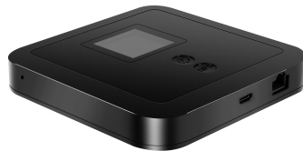
5G MiFi SHFi5GMX55A