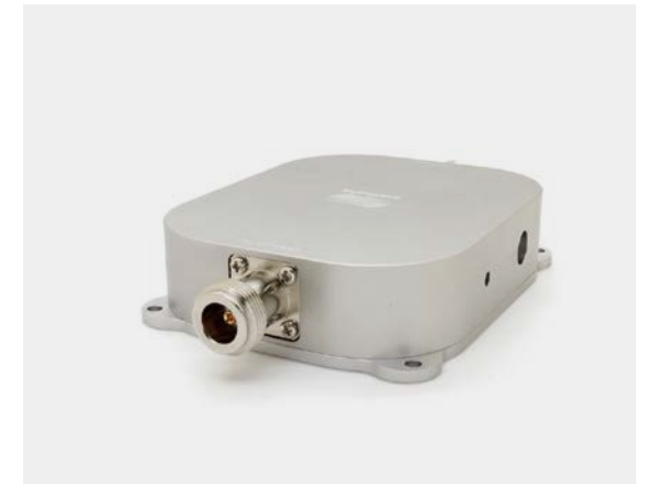
SHPro5824G4W/SHPro5824Go4W 2.4&5.8G 4W Indoor/Outdoor