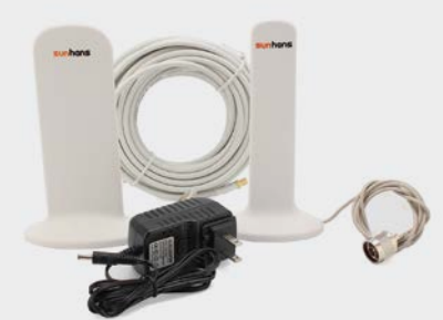
Whip antenna set