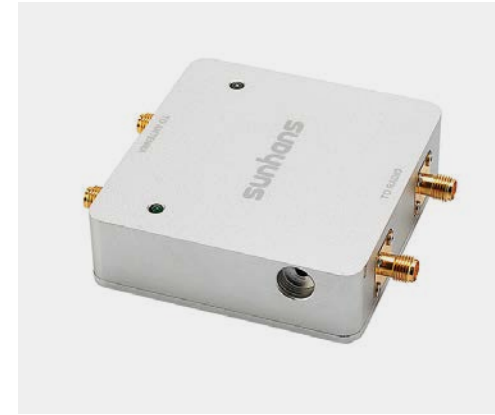
SH24Gi1000D2P 2.4GHz 1W 30dBm Indoor