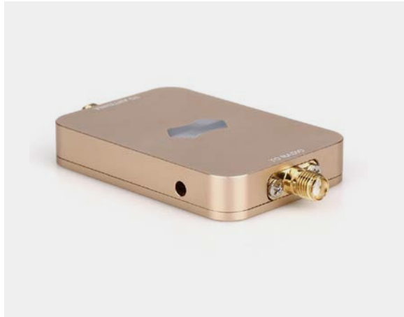
SHRC24G3WP 2.4GHz 3W 35dBm