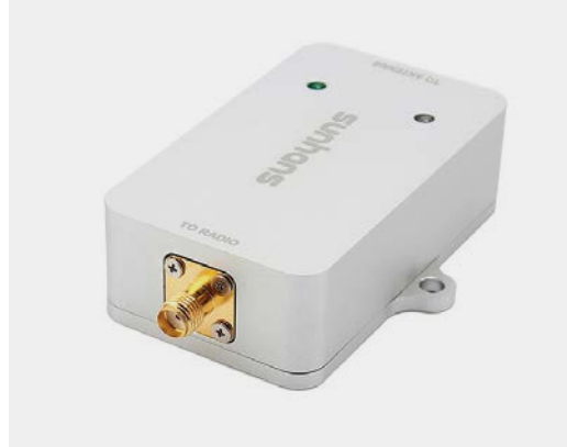
SH58Gi2000P 5.8GHz 2W 33dBm Indoor