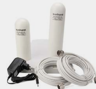
Fiberglass antenna set

Choose the repeater accessory kit, or only repeater