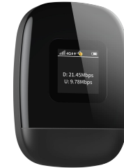
Cat12 4G MiFi SHFi4G9X42