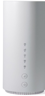
Cat6 4G Indoor CPE SHFi4GC091