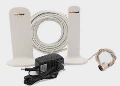
Whip antenna set