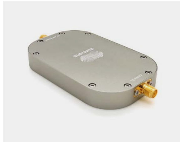
SHRC5824G2WP 2.4GHz/5.8GHz 2W 33dBm