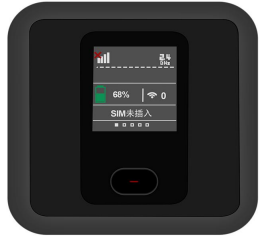
Cat6 4G MiFi SHFi4G9X6A